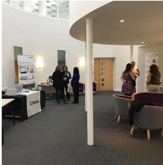
Exhibitions of Industrial partners during lunch time.

A standard working lunch was then provided after the morning session. This time was well spent by the delegates, who engaged in interesting conversations with colleagues and posters viewing.