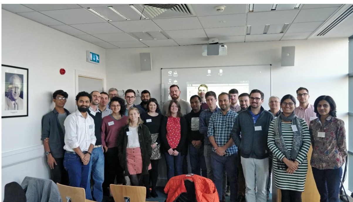
Fig. 5 Participants of third ISE satellite student regional symposium on electrochemistry in Ireland.